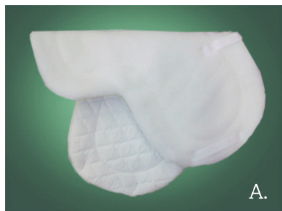
A. Style #01 Our most popular show pad. Fleece top with no extra foam for the maximum contact with the horse.