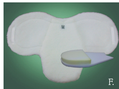
F. Style #04B This pad offers an extra 1" of foam from pommel to cantle plus a 2" foam cantle insert. This is our thickest pad, it protects the horse's back while lifting the cantle for the rider.