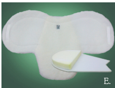
E. Style #04A This pad offers an extra 1/2" of foam from pommel to cantle plus a 2" foam cantle insert. It protects the horse's back while lifting the cantle for the rider.