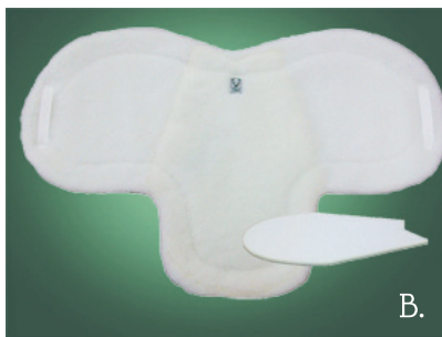
B. Style #02A This pad offers an extra 1/2" of foam from pommel to cantle. The flap area is not padded to allow maximum contact with the horse.