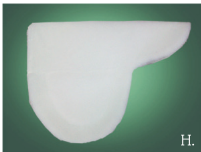
H. Style #04D A very popular saddle pad for those riders who use gel pads, this pad has a wide velcro opening at the pommel that allows the gel pad to be inserted and removed with ease.