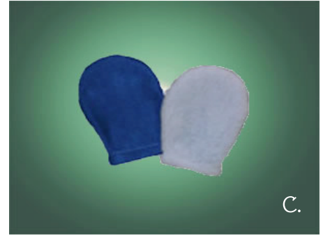
C. Style MM The Mighty Mitt. Use it to brush, shine, or wash your horse. Available in different colors or all white. You can even polish your boots with it!