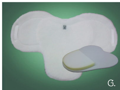
G. Style #04C A unique combination of a 1/2" heart shaped foam panel from pommel to cantle, plus an extra 1" foam insert in the cantle area. This protects the wither while slightly lifting the cantle.