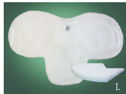
I. Style #06 We've sewn an extra 1" of foam into the pommel area only, to help protect horses with sensitive withers, or to lift the pommel of the saddle.