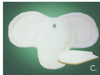
C. Style #02B This pad offers an extra 1" of foam from pommel to cantle. The flap area is not padded to allow maximum contact with the horse.