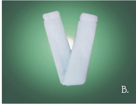
B. Style #10 Cribbing Strap Cover. Available in all fleece or fleece with a cotton quilted bottom. Also available with Novelty Print, Plaid, or Colored Polar Fleece top.