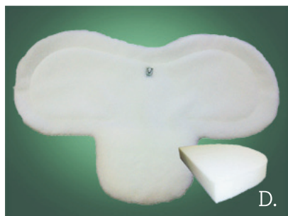
D. Style #03 This pad has an extra 2" of foam sewn into the cantle to build up the seat area of the saddle.